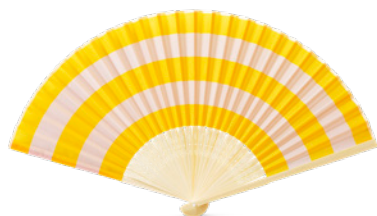
Fan foldable bamboo 20€