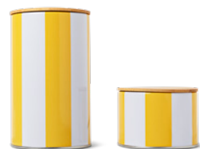
Can w. bamboo lid. From 2€