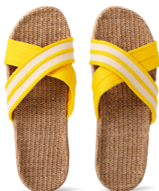
Slippers straw yellow 5€