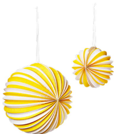
Decoration fold out ball 5€