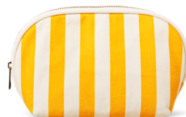
Toiletry bag 5€