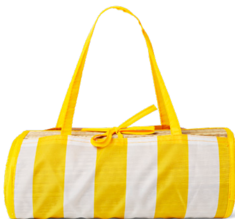
Blanket picnic 5€